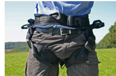
Correctly applied harness